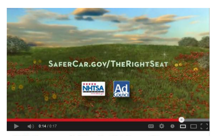
Child Passenger Safety - Oz Click Away:15

The Ad Council has recently distributed the new Oz CPS public service announcements (PSAs). Links to view the TV spots on Ad Council's YouTube Page are below. In addition to TV, we also released radio, web banners and outdoor PSAs in both English and Spanish. In addition to NHTSA and Ad Council, Warner Brothers also plans to promote the PSAs through their social media accounts. Feel free to share these videos on your organizations website and social media outlets.